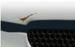
SCRAPES / DEEP SCRATCHES