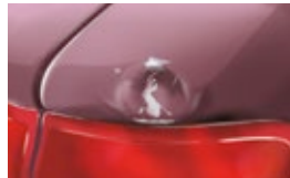
EXPOSED UNDERCOAT OR METAL