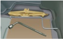
WHEEL BRACE, JACK & JACK HANDLE ARE RETURNED