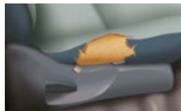
DAMAGE TO SEAT