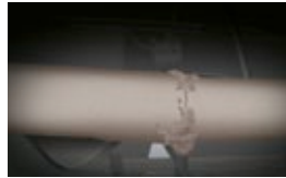
DAMAGED EXHAUST SYSTEM