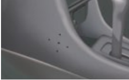
HOLES CAUSED BY ACCESSORY REMOVAL