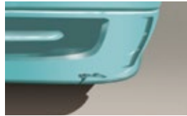
BROKEN BUMPERS & MOULDINGS