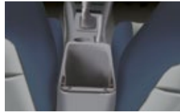
MISSING CONSOLE LID